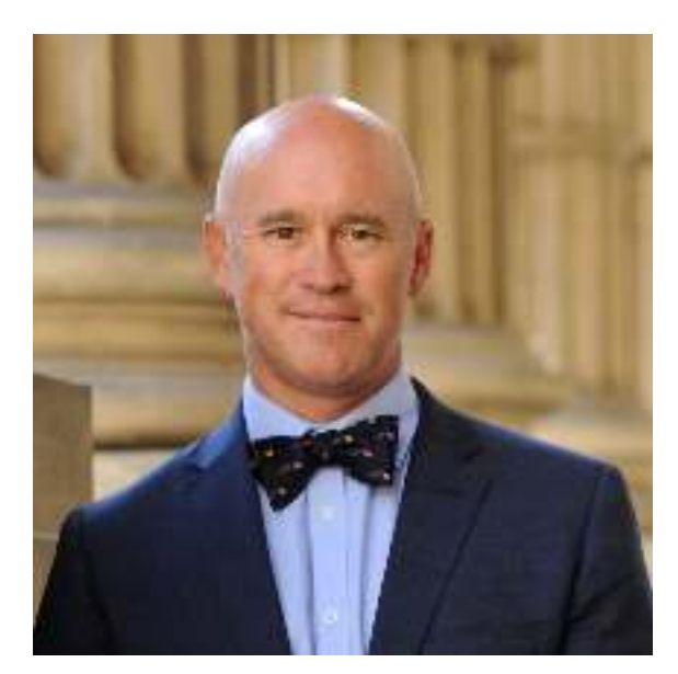
by Omar Jordan

The following information is a presentation of evidence, combined with my opinions , based on factual details available in the public domain. My opinions are based on the evidence. I do not claim to present an overarching or objective truth, and I encourage all readers to engage in their own research by following the links available in this document. It is up to each individual to research for themselves in order to determine whether or not your conclusions align with my assessment and analysis of the evidence. Consider this document a <u>starting</u> <u>point</u> to a larger body of research and more thorough investigation.